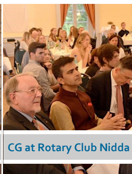
CG at Rotary Club Nidda