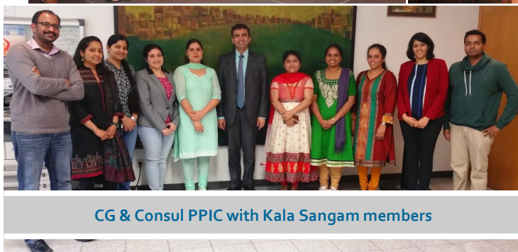
CG & Consul PPIC with Kala Sangam members