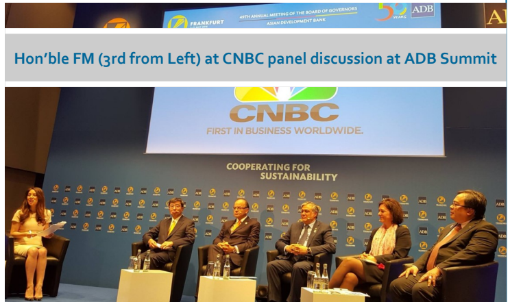
Hon'ble FM (3rd from Left) at CNBC panel discussion at ADB Summit

The 49th Annual meeting of the Asian Development Bank was held in Frankfurt from 1-5 May 2016. In this context, Hon'ble Finance Minister Shri Arun Jaitley visited Frankfurt on 4th May 2016 and attended the 49th Annual Meeting of the Board of Governors of the Asian Development Bank. The Hon'ble Minister attended the first Business Session of the Board of Governors where he made a statement. He also held meetings with the delegates of many other countries including that of Germany during his visit. Hon'ble Finance Minister was also a part of a televised panel discussion by CNBC where he spoke about the changing India and its growth potential.