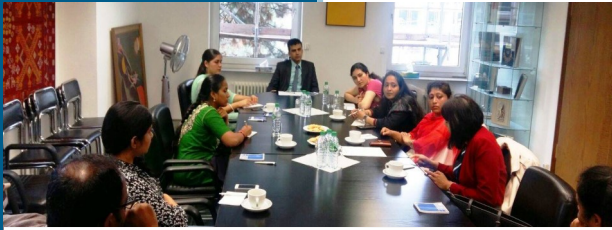
CG chairing the Kala Sangam Meet

The 3rd Annual Meeting of Kala Sangam was held at CGI Frankfurt on 1st June 2016. Since its formation two years ago, Kala Sangam has made progress in achieving its goal of providing suitable platforms to Indian artists based in Germany. The number of artists/groups who have registered with us is around 40. Kala Sangam artists/groups have performed at various occasions, including National Day receptions and other events organised by the Embassy and the Consulates, cultural performances organised by Indian cultural bodies. The meeting was a well timed one coming right after the much appreciated 'Indradhanush' initiative of the Consulate.