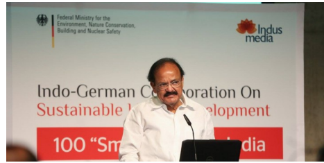
Hon'ble Minister in Berlin

Hon'ble Union Minister for Housing and Development Shri Venkaiah Naidu visited Berlin to discuss development of Smart Cities in collaboration with Germany. Here he can be seen addressing the gathering at Berlin on India's Smart City Mission. For the information of our readers, Bhubaneswar, Kochi and Coimbatore have already been identified as cities to be developed as Smart Cities with German collaboration