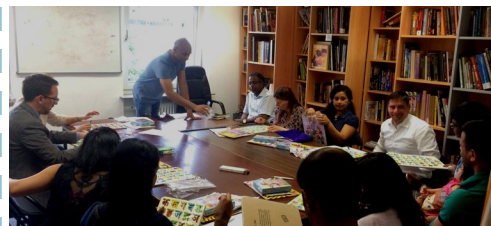
Students with their Hindi teacher