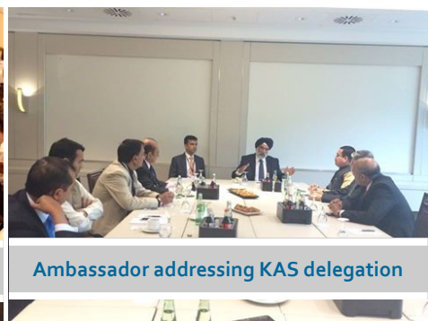
Ambassador addressing KAS delegation