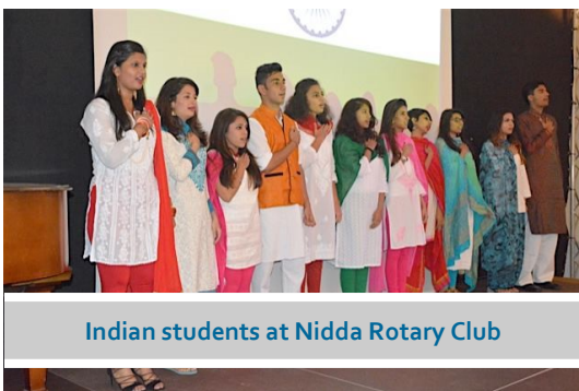
Indian students at Nidda Rotary Club