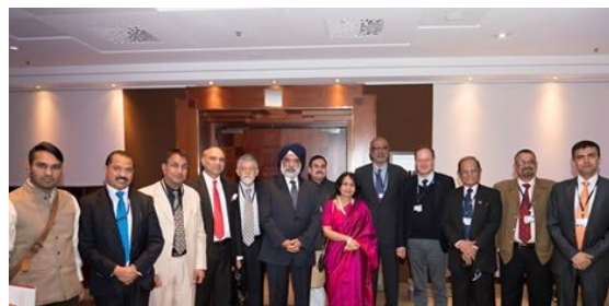
Ambassador & CG with KAS delegation